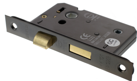
Product Finish Pictured: Black Nickel (BN)